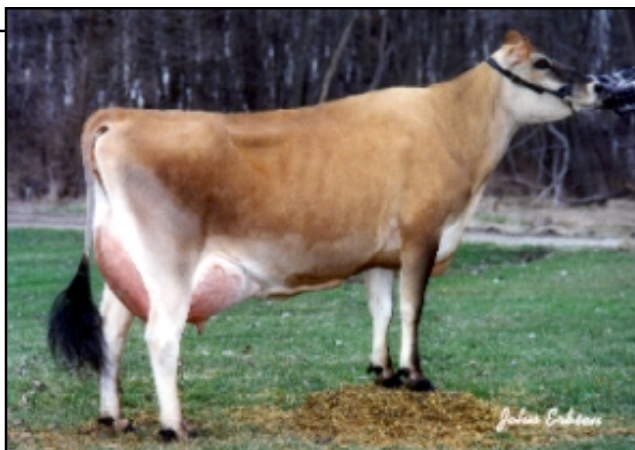
BOHNERTS BUCK ABIGALE, E-90% Dam of Lot 67