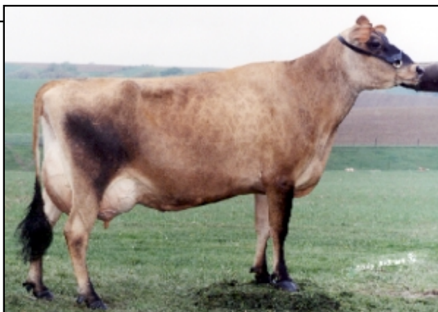
GR CCJ BARBER MOLLY, E-90% Dam of Lot 5