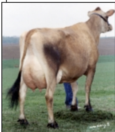
GR CCJ BARBER MOLLY

PR CCJ 29 RHONDA USA 368047988 TATTOO A92 2-0 305 2 15820 4.3 684 3.7 583 DHI R 3-1 305 2 18740 4.6 870 3.8 704 DHI R 365 2 22050 4.7 1042 3.8 838 DHI R 4-5 305 2 15002 4.8 726 4.0 606 DHI R PPA -1179M -12F -25P YD -1806M -8F -30P USDA PTA 05/01/2001 2RECS 50%R 12%I LE -267M -9F -10P -127CMS -123NMS -109FMS AJCA 05/01/2001 PTAT 26%R -0.3 PTI 47%R -55 SI RE: SOLDI ERBOY BOOMER SOONER OF CJF PTI 53 2%I LE